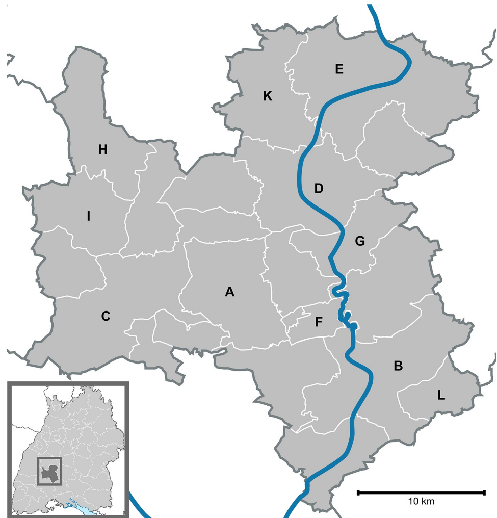
Fig 1. The administrative district and its 21 municipalities.

https://doi.org/10.1371/journal.pone.0208003.g001