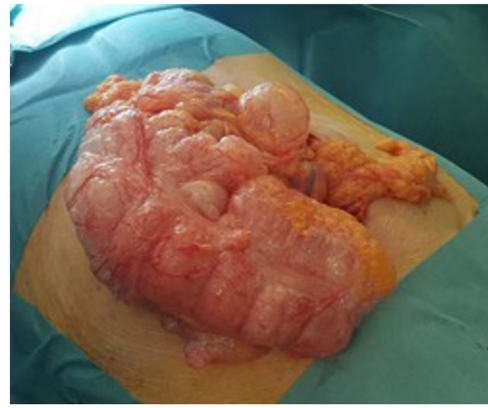
Fig. 3. Intra-operative finding of pneumatosis of the right colon.

A 65-years-old woman affected by diabetes, lichenoid dermatitis, hypothyroidism, severe cognitive impairment, epilepsy and PEG-bearer was admitted to the Emergency Department for incoming epileptic seizures. She had been previously hospitalized for respiratory failure caused by an ab ingestis episode (MRSA pneumonia), that needed a temporary tracheostomy. The patient was unresponsive, GCS 8. Laboratory tests revealed a severe leukocytosis (WBC counts 33.95 \times 10^3 ), blood acidosis (Ph 7.37, lactate 98 mg/dL, Base excess - 6.7 mmol/L), both signs of a severe septic shock and initial multiorgan failure (creatinine 0.87 mg/dL) and hypotension. On clinical examination her abdomen was tender and swollen to palpation without any signs of ongoing peritonitis. An abdominal CT scan revealed a dilated large intestine with parietal pneumatosis from the appendix to the transverse colon associated with extensive pneumoperitoneum (Figs. 1 and 2). The patient was sent to the operating room. Intra operatively we reported the pres-