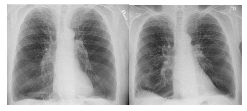
Figure 3: A posterioanterior (PA) chest X-ray comparing preoperative (left) to postoperative (right).