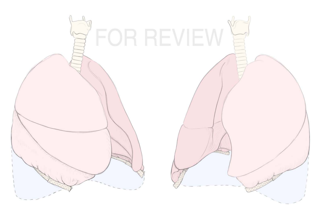
Figure 2: Artist rendition of bilateral lower lobe LVRS.

Lower lobe predominant emphysema can present with normal alpha-1 antitrypsin level or alpha-1 antitrypsin deficiency (AAD) [5]. Gelb et al. [6] reported their experience with lower lobe LVRS in six patients with AATD. LVRS was staged and performed via VATS. Improvement in FEV<sub>1</sub> and DLCO along with reduction in RV was observed. Cassina et al. [7] evaluated 18 COPD patients, with normal alpha-1 antitrypsin level. There were similar physiologic benefits up to 6 months, however in AATD group lung functions (except 6MWD) returned to baseline at 1 year and declined at 24 months. Tutic et al. [8] reported similar observations in 10 COPD patients with AATD who underwent lower lobe LVRS.