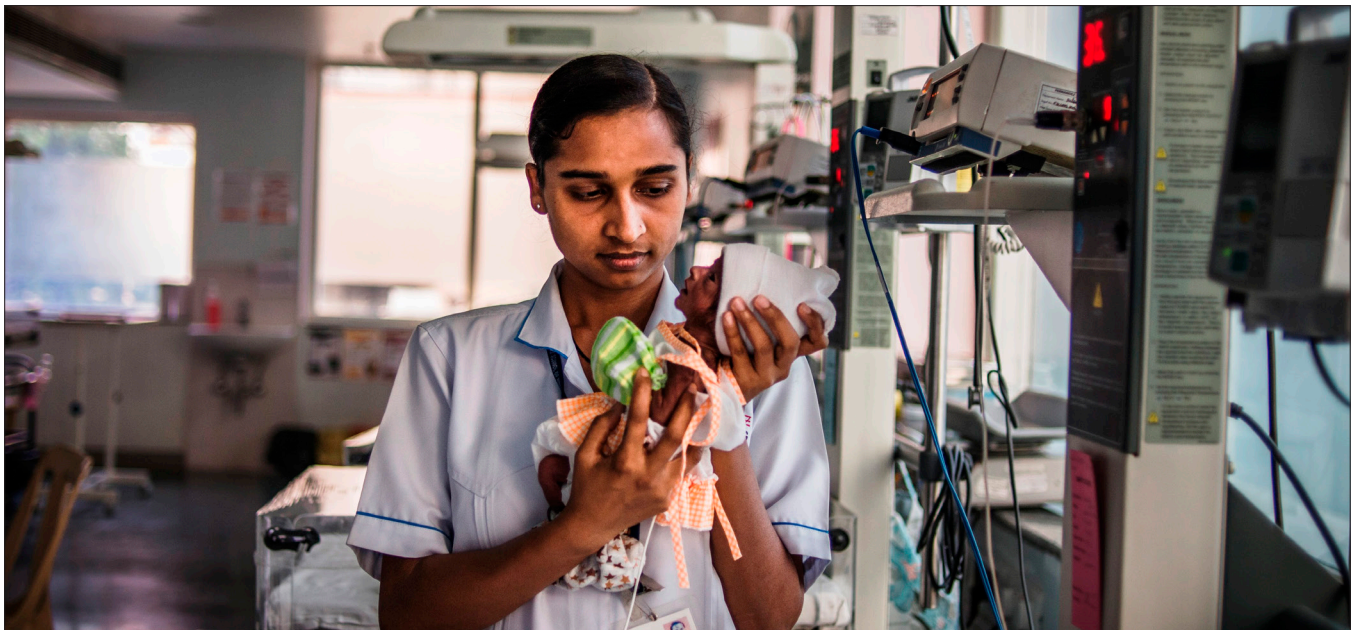
A nurse in the neonatal intensive care unit of Fernandez Hospital, Hyderabad, with a premature baby she has just fed.