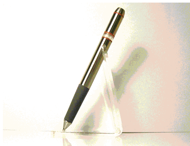
Figure 1. The biofeedback pen, consisting of a pressure sensor with a red light at the end of the shaft. When too much hand force is applied during writing, the red light signals the subject to loosen the grip.

Muscular resistance and joint resistance limit the rotation of the head. In the present study, we assessed the maximum head rotation until the muscular restriction was reached. To distinguish between muscular and joint resistance, all measurements were done by the same experienced physiotherapist. The head rotation was assessed with a CROM (Cervical Range of Motion) device (Performance Attainment Systems of Roseville, Minnesota). This device measured the CROM for flexion, extension, lateral flexion and left-right axial rotation using separate inclinometers (16). In this study, we only assessed bilateral axial rotation of the neck. The mean blood flow velocity of the radial artery, v_{\text{rad.art.mean}} , was measured in both arms just proximal to the wrist. Measurements were performed using a Versalab (Nicolet Vascular Versalab, serial number: SEC0106); a small echo-Doppler device that detects velocity profiles in arteries and veins. The 8 MHz probe was held at an angle of 45 degrees to the skin surface. This position was secured using a simple probe holder. The 1-minute writing exercise was done using a specially developed biofeedback pen, see figure 1. The shaft of the pen contains a pressure sensor and a red light. When too much hand force was applied on the shaft, the light switched on. All police officers were instructed to follow an instruction protocol.