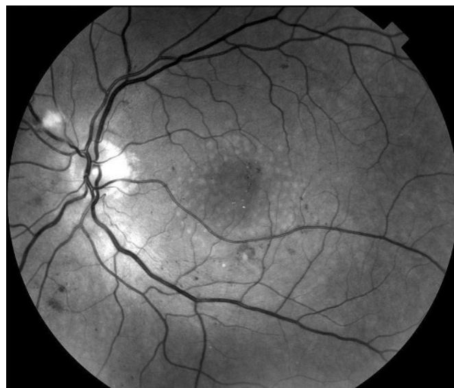
Figure 2 Red free fundus photographs of a macular grid applied using the Pascal pattern in diffuse diabetic macular oedema. Notice the evenly distributed burns.

allowed us to directly compare the laser power needed using a 100 ms burn for the conventional treatment with the laser power needed for the same eye during the Pascal episode using a 20 ms burn. The average power with the conventional photocoagulator for these 22 procedures was 235 mW (SD 57.2, range 170–400), and the mean number of burns was 738 (SD 231.2, range 320–1178). The Pascal parameters used for these 22 procedures were as follows: mean power was 396 mW (SD 100.2, range 250–750), and the mean number of burns was 1116 (SD 417.2, range 500–2063). The difference in powers used with the conventional and the Pascal lasers for these 22 patients was highly significant ( p < 0.001 ), being 396 mW for Pascal compared with 235 mW for conventional laser. Though not specifically looked at in this study, it was generally