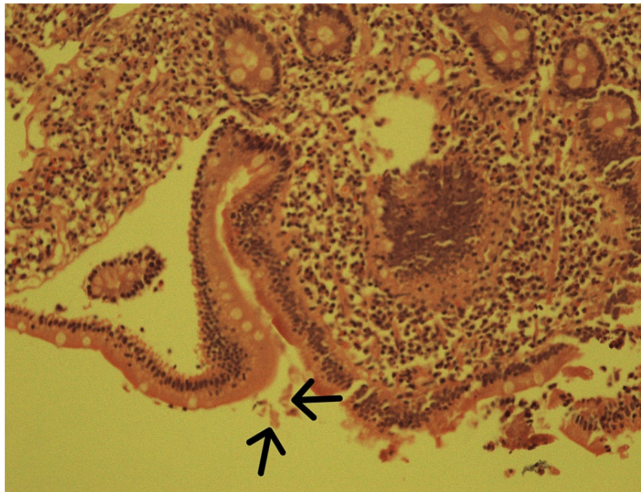
FIGURE 1: Histology slide of duodenal biopsy showing vegetative forms of G. lamblia (labeled with arrows)

The patient followed up after a week, without resolution of abdominal pain even after undergoing surgery. The MRE report showed no evidence of bowel stricture, wall thickening, fold thickening, abnormal enhancement, or mass lesion. Repeat routine stool examination was normal. However, the level of fecal calprotectin was raised (251 µg/g). Accordingly, endoscopy and colonoscopy were advised. Duodenal biopsy revealed vegetative growth of G. lamblia with no evidence of celiac disease. (Figure 1 and Figure 2).