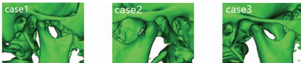
Figure 2. Three-dimensional computed tomography reconstructions of the 3 patients' temporomandibular joint dislocations.

and palate. She had undergone cheiloplasty and palatoplasty at age 3 months and 12 months. She also underwent palatal fistula repair and secondary cheiloplasty at 8 years old. The patient presented a severe cleft maxillary hypoplasia and malocclusion after puberty. After a Le Fort I osteotomy in July 2017, the distraction was started and lasted for 4 weeks. The A point was moved 25.52 mm anteriorly and 3.37 mm inferiorly after the distraction. In the late stage of distraction, the patient gradually experienced a decrease in mandibular mobility and in mouth opening without significant pain. At the completion of the distraction the patient could barely move the jaws. CT revealed displacement of the right mandibular condyle away from the articular fossa to the anterior inferior aspect of the articular tuberosity (Fig. 2). The measurements revealed a 9.75° decrease in saddle angle and an 11.25° increase in articular angle compared to the preoperative period. After distraction, the palatal plane angle increased by 19.70°, the mandibular plane angle increased by 1.11°, the upper gonial angle decreased 2.64°, and a 4.44° increase in the lower gonial angle was seen, indicating an anterior and inferior displacement and a clockwise rotation of both the maxilla and mandible. The dislocated condyle was immediately repositioned by manipulation. Subsequently, the RED device was removed, and internal rigid fixation of the maxilla,