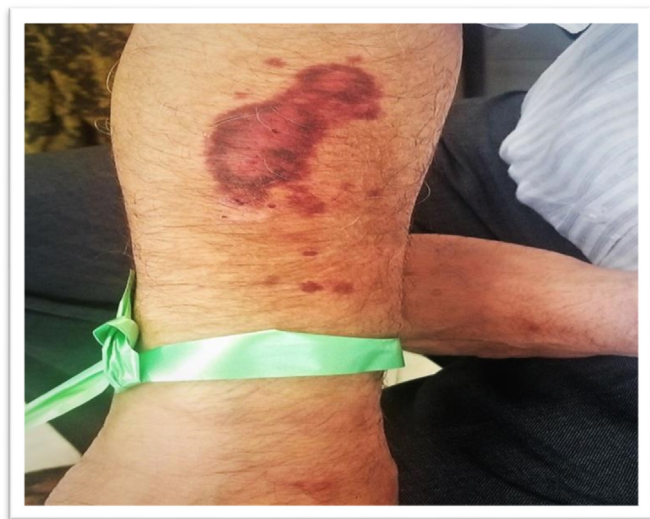
Fig. 1. Ecchymosis on right hand.