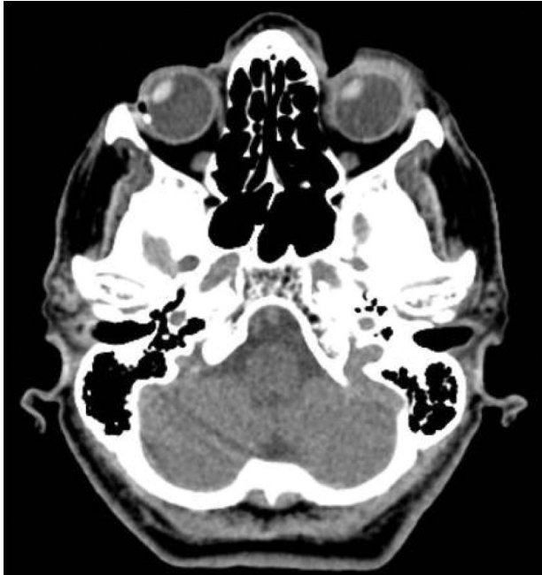
Figure 1. Non-contrast computed tomography (CT) scan showing conjugate eye deviation to the right side.

sign” on tomography, following an acute subinsular stroke and in the absence of conjugated eye deviation. Our hypothesis was that the sign may have been due to hemispatial neglect in this patient. The aim of this article was to discuss the mechanisms involved in the attention network and its neuroanatomic correlates.