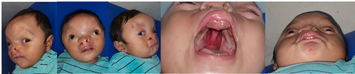
Fig. 6. At 3 months after operation.

malformation also showed a short distance between medial canthi to nasion and a wide cleft state. The skin was lax enough with no scar/wound.