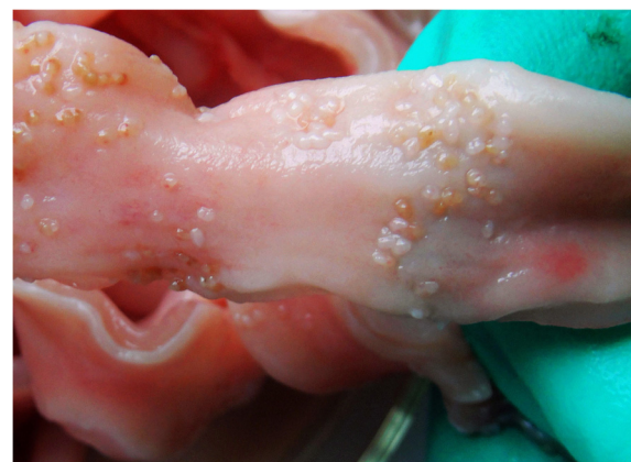
Fig. 2 Adults of the trematode species Pharyngostomum cordatum on the pharynx of a cat

reported from Heilongjiang (36.5 %) and Hunan (45.2 %), respectively [8, 9]. In cats, infection rates with Toxocara cati (5.1 %) and Toxascaris leonina (7.7 %) were relatively low in comparison to previous surveys [10, 11]. Toxocarosis is considered as one of the most common parasitic zoonoses in the world and a high incidence has been reported in developing countries. However a few investigations have been made in China and there is only one report indicating that contact with infected dogs is the risk factor for human toxocarosis in China [25]. With regard to Toxocara in cats, Li et al. [26] mentioned the presence of a new Toxocara species ( T. malaysiensis ) in Guangzhou, China. This parasite seems to be remarkably different from T. canis , T. cati and T. leonina of dogs and cats by molecular characterization [26]. However, the role of T. malaysiensis as a zoonotic parasite has yet to be confirmed.