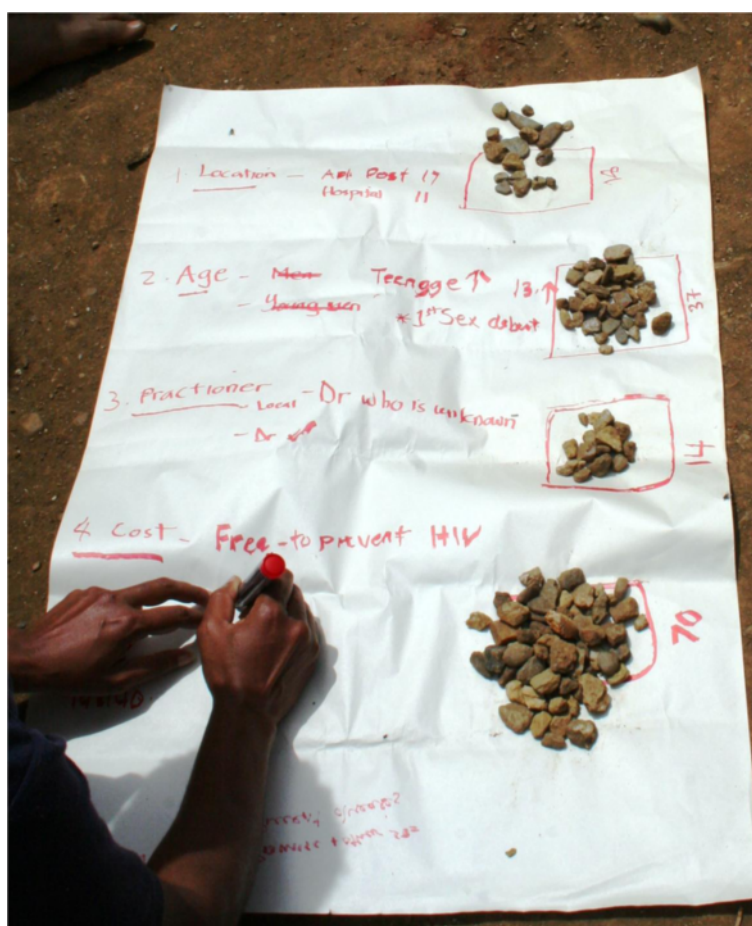
Figure 3 Example of an activity completed during participatory workshops.

transmitted then. Young women focus group discussion, ESP