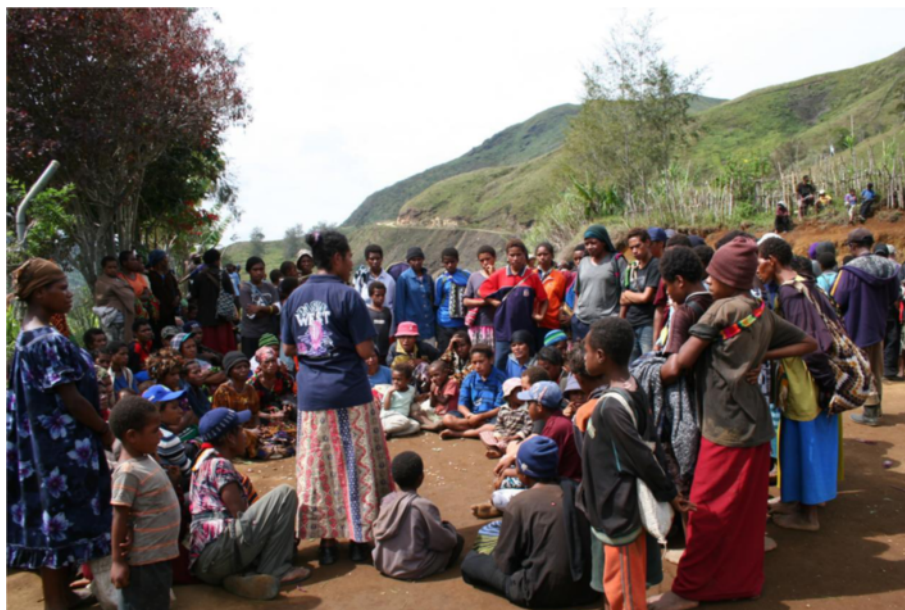
Figure 2 Participatory workshop on service delivery models for MC for HIV prevention.

witnessed thumbprint). For those taking part in community workshops, verbal consent was obtained prior to commencing the activity. This research adheres to the qualitative research review guidelines (RATS).