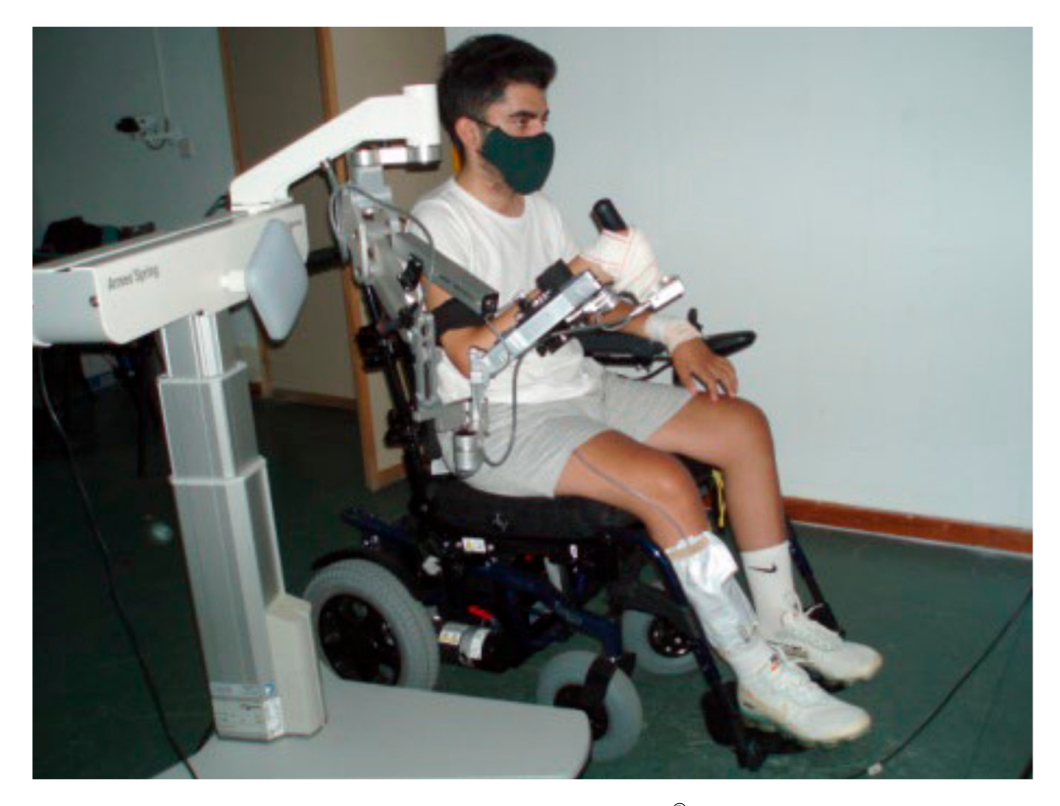
Figure 2. Patient during an experimental session with Armeo<sup>®</sup>Spring device.

All the patients received 30 min of CT daily based on UL functional and ADL treatment. In addition, patients in the control group received another 30 min of CT, whereas patients in the intervention group received 30 min of ULRT. Thus, all the patients were scheduled for five 1 h sessions per week for 8 weeks to complete a total of 40 sessions. A maximum of 10 weeks was permitted to complete the treatment. Each ULRT session by means of the Armeo<sup>®</sup>Spring device (Figure 2) was divided into two parts: (1) normalized games for 15 min within Armeo software and (2) training of the ADL of drinking for another 15 min. The ADL of drinking using a virtual application was designed and developed through the collaboration that our center has maintained with the Technological Centre VICOMTECH. In the game, the patient, instrumented with the Armeo Spring device, has to reach and lift a glass on the table, perform a UL proximal movement to the mouth, simulate a swallow, perform the UL distal movement to the table, release the glass, and return to the initial point.