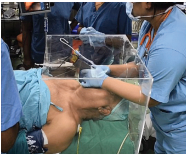
Figure 1: Aerosol box

Our box is a modification of an aerosol box described by Lai Hsein-Yung. [3] An aerosol box is a transparent box, designed to cover the patient's head during airway related procedures where the patient is likely to cough. We have also used acrylic, as it is cheap, strong and easily available in resource poor country like India. The dimensions used to make this box are given in Figure 1. Our box is ergonomically designed with asymmetrical placement of the openings for the hand. The circular opening has been changed to elliptical, and the left side opening is larger and higher than right. The shape of the openings is elliptical as the hands come from lateral to medial and require some maneuvering while intubation. A base of 51 cm (50 cm in original design) was selected so that it just fits on our OT table