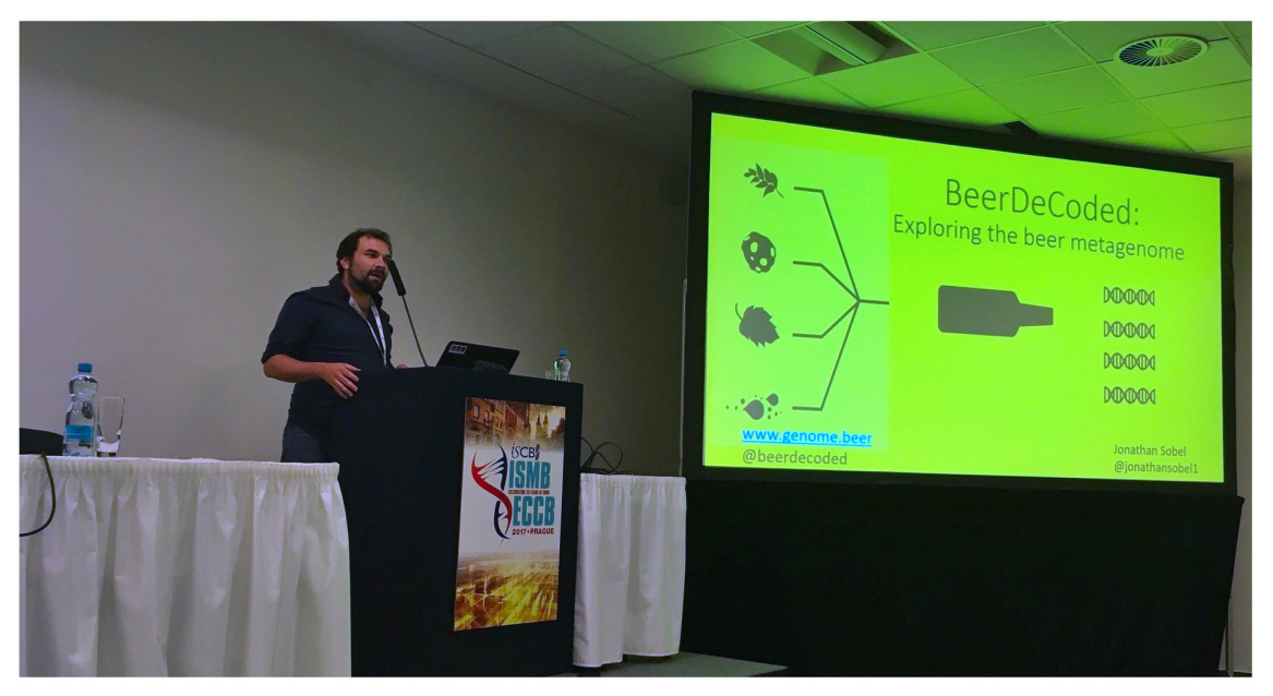
Figure 7. Jonathan Sobel of Hackuarium talking about BeerDeCoded at BOSC 2017.