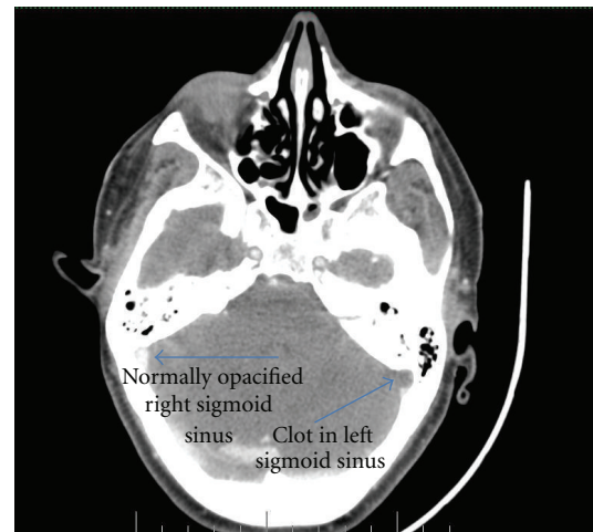
FIGURE 2: CT scan of the head and neck with contrast demonstrated a thrombus in the left sigmoid sinus.

intravenous Clindamycin and Vancomycin. Unfractionated heparin was also started due to the extensive clot burden. Workup for autoimmune and hypercoagulable diseases was unrevealing for any abnormality. Autoimmune workup included anti-nuclear anti-bodies (ANA), rheumatoid factor (RF), cytoplasmic antineutrophil cytoplasmic antibodies (c-ANCA), perinuclear anti-neutrophil cytoplasmic antibodies (p-ANCA), anti-Ro/SSA and anti-La/SSB antibodies. Hypercoagulable workup included prothrombin time (PT), partial thromboplastin time (PTT), international normalized ratio (INR), factor V Leiden mutation, prothrombin gene mutation, protein C and S as well as antithrombin levels, anti-cardiolipin antibodies and lupus anticoagulant.