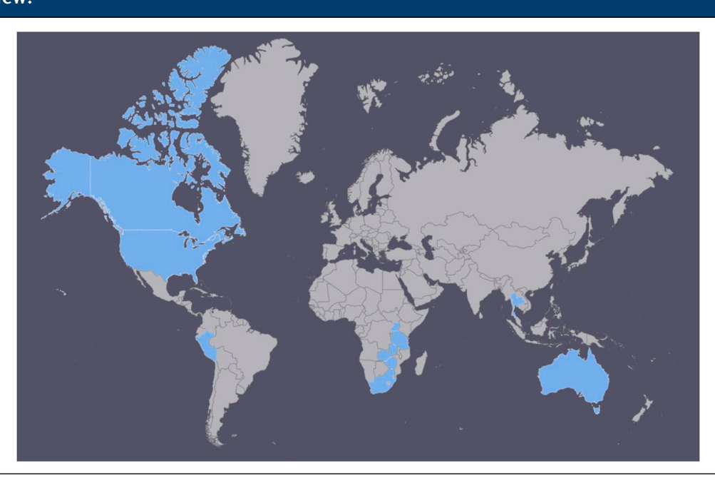
Figure 2. Map showing distribution of studies included in the values and preferences review.

been substantial interest in lubricant use to reduce the risk of condom breakage and thus reduce HIV/STI risk, <sup>42</sup> our review did not identify studies in this area. It is possible that many HIV trials provide condoms and lubricant to both study arms and thus do not provide comparative data on lubricant use versus no lubricant use, or that they measure outcomes such as condom slippage or breakage which were not in our a priori list of outcomes. It is also possible that our search string, which focused on studies with lubricant terms in the title or abstract, did not catch these trials.