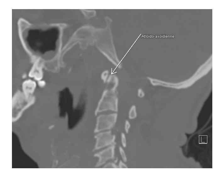
FIGURE 1 Osteolysis in synovial fold zone of the atlantoaxial articulation in CT scan

Echocardiogram shows a good function of the left ventricle and no signs of cardiac amyloidisis.