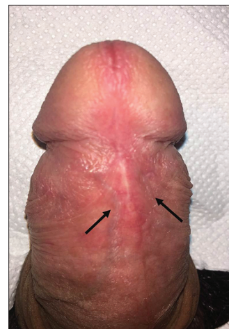
Figure 3: The named frenular veins are seen intact flanking each side of the midline (arrows) in a case at 2-month follow-up