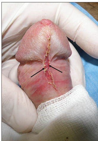
Figure 2: Paired frenular arteries (the left and right branches) are easily seen lying undamaged at the frenular bed (arrows)

A possible limitation of our study is that no proper calibration of the meatus using a sound or catheter was used to compare pre- and post-operation caliber of the urethral meatus. However, this was deemed unnecessary as voiding symptoms are usually sufficient in unveiling an underlying pathology. [8] Moreover, thorough inspection of the meatus during the follow-up visit did not reveal the