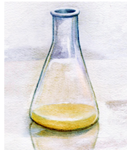
Figure 4. Painting produced exclusively with biopigments extracted from Streptomyces and suspended in acrylic binder. doi:10.1371/journal.pbio.1000510.g004

Whereas small quantities of pigment are sufficient for making paints used in an artist's studio or a classroom, massive quantities of pigments are required for industrial applications. Therefore, the