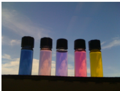
Figure 3. Extracts from Streptomyces cultured on semi-solid agar plates. S. coelicolor extracted with water (A) and after addition of dilute acid (B); S. violaceoruber Tu22 extracted with ethyl acetate (C) and after addition of dilute hydrochloric acid (D); S. roseofulvus extracted with ethyl acetate (E). doi:10.1371/journal.pbio.1000510.g003

from Streptomyces pigments, the dried, colored extract must be resuspended in a binder. In our experience, Streptomyces pigments are extremely compatible with acrylics, which have emerged as the predominant class of paint binders in the latter half of the 20th century. To make a homogeneous paint, the pigment should be finely ground prior to the addition of a minimal amount of acrylic binder. Solvents (e.g., water for acrylic paints or petroleum distillates for oil-based paints) can then be added to optimize the application properties of the paint. Figure 4 shows an example of a painting produced with four different