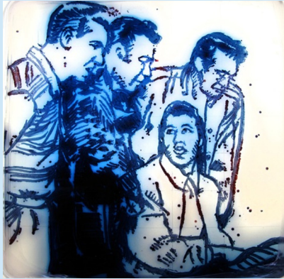
Image 1. "Elvis Lives!" painted on R5 media plates using S. coelicolor . doi:10.1371/journal.pbio.1000510.g005

Since Streptomyces spores spread over a limited distance when cultured on semi-solid agar medium, the site of inoculation of a petri-dish will determine the boundaries of bacterial growth [1]. Thus, the spores of Streptomyces can be used as paint, and the artist's brush strokes will dictate the final image (for example, see Image 1).