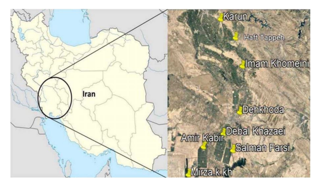
Figure 3. The geographical origins of Aspergillus strains isolated from the sugarcane rhizosphere in the South of Iran. Pins indicate the areas where the rhizosphere samples were collected.

The occurrence of Aspergillus species was evaluated in the rhizosphere of eight sugarcane sites in the South of Iran (see Figure 3 and Table 3), where the sugarcane is the main agro-food product. The number of Aspergillus strains isolated in this study varied from region to region: Imam Khomeini and Haft Tappeh sites showed the highest and lowest number of isolates, respectively. These differences in the distribution of strains among the regions might be related to significant specific environmental and biological features of each site, such as the microbiome profile [29,30], fungal antagonist occurrence [31], and soil moisture and temperature [32]. However, inadequate knowledge on the sites sampled prevents us from drawing further conclusions.