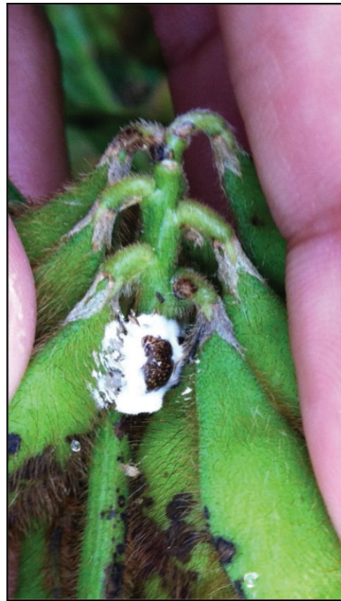
Fig. 6. Kudzu bug infected with entomopathogenic fungus B. bassiana .

Plants possess resistance mechanisms in the broad categories of anti-xenosis, antibiosis, and tolerance to protect themselves against the attack of phytophagous insects. Host plant resistance has great potential in IPM, as using this technique reduces the need to spray broad-spectrum insecticides and is a more environmentally friendly option. Soybeans, too, have the ability to defend themselves against biotic and abiotic stress. Soybean breeders have developed many resistant varieties through traditional plant breeding resulting in nematode-, stink bug-, aphid-, and defoliator-resistant soybean lines (Bray et al. 2016, Fritz et al. 2016). Over 40 soybean varieties from maturity groups V–VIII with diverse traits in pubescence type, leaf shape, seed size, nitrogen fixation, drought tolerance, seed protein content, and pest resistance were evaluated in North Carolina in 2013 and 2014 for resistance to kudzu bugs (Fritz et al. 2016). The study found that narrow-leaf, small-seeded cultivars ‘Vance’ and ‘N7103’ as well as the non-nodulating cultivar ‘Nitrasoy’ showed the highest resistance to the kudzu bug. Vance belongs to MG V and both N7103 and Nitrasoy belong to MG VII. Knowledge about these lines and many more being currently studied will assist soybean breeders in developing resistant soybean lines that will suffer minimal yield loss without the need to spray insecticides multiple times at high doses.