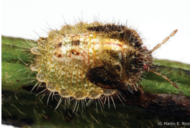
Fig. 5. M. cribraria nymph (fifth instar).

The authors described the spatial distribution in South Carolina in 2011 and 2012. Soybean varieties from maturity groups VI and VII were planted in May, whereas VIII was planted in June. Peak levels of adults were reached in September to early October in both years in South Carolina, and this trend was also seen in previous studies in Georgia. Egg mass numbers peaked in early August during both years, which was also in agreement with studies in Georgia. Higher densities of kudzu bug adults and nymphs were seen at field edges, and the bugs exhibited an aggregated distribution as opposed to having a random or uniform distribution. Adults and nymphs were also spatially associated on individual sampling dates as well as throughout the season. This means that kudzu bugs colonized the field edges and remained aggregated at the edges throughout the season; when nymphs hatched, they were found foraging close to the adults. Therefore, scouting should commence on field edges to identify if the kudzu bug is present. If the kudzu bug is present, scouting should continue throughout the field.