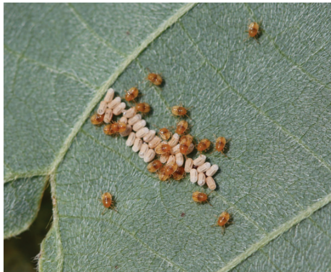
Fig. 4. Egg mass of the kudzu bug with newly hatched first-instar nymphs.