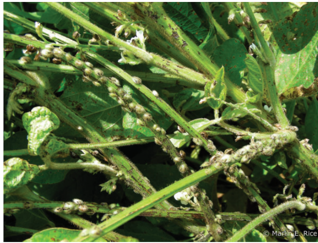
Fig. 1. M. cribraria adults and nymphs on soybeans.