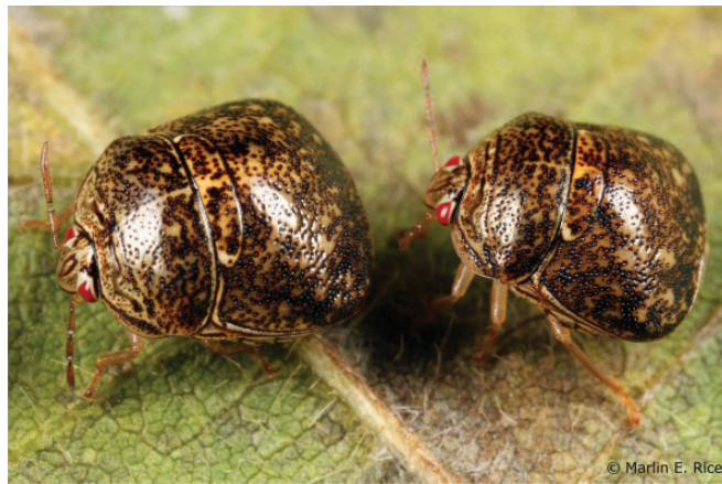
Fig. 2. M. cribraria adults.

bugs have been found on many different legume and non-legume hosts, the primary reproductive hosts in the United States are reported as soybean, kudzu, pigeon pea ( Cajanus cajan L.), black eye pea ( Vigna sinensis L.), lima bean ( Phaseolus lunatus L.), pinto bean ( Phaseolus vulgaris L.) (Medal et al. 2013), wisteria ( Wisteria sinensis Sims) (Ruberson et al. 2013), white sweet clover ( Melilotus alba Medikus), white clover ( Trifolium repens L.), red clover ( Trifolium pratense L.), alfalfa ( Medicago sativa L.), perennial peanut ( Arachis glabrata Benth), and American joint vetch ( Aeschynomene Americana L.) (Medal et al. 2016).