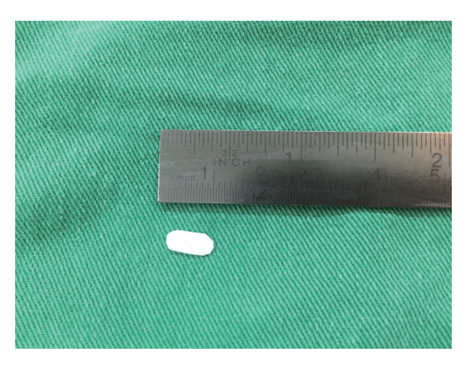
Fig. 3 - Trimmed Polyester urethane dural substitute patch which was inlaid within the dural defect.