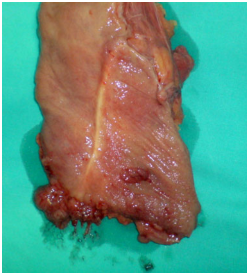
Fig. 3 Excised “J”-pouch. In its lower portion, there is a focus of adenocarcinoma. There are also adenomatous polyps with low- and high-grade dysplasia in FAP patients 15 years after restorative proctocolectomy

In this study, dysplasia and neoplasia were found in 15.7% of cases. Their distribution varied at different times after surgery. In a group 0–10 years after the surgery, low-grade and high-grade dysplasias were