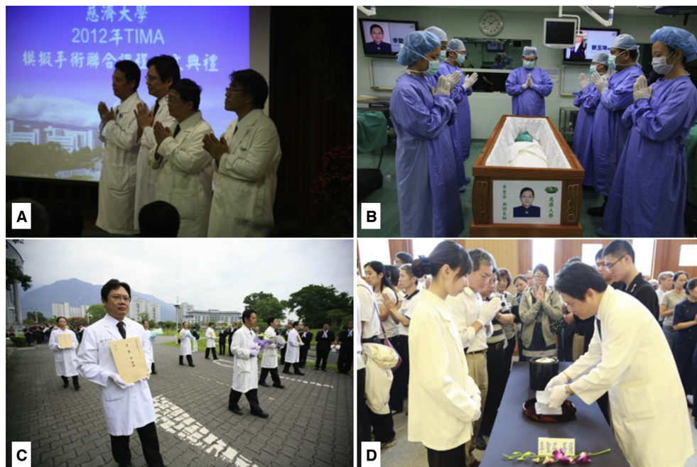
Figure 2. A series of interactive humane activities regarding the silent mentor program. (A) The opening ceremony of the silent mentor program. (B) Encoffining. (C) Parade after cremation. (D) Shrine ceremony.

Hualien City is a beautiful city in Eastern Taiwan; it faces the Pacific Ocean and is surrounded by the Taroko National Park. The APAGE or TAMIG can both consider initiating a regular silent mentor program in the MSC of TCU. It is not only for improving the