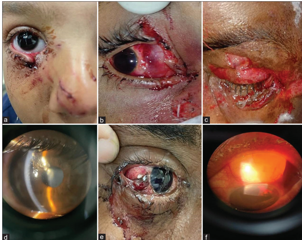
Figure 2: The Clinical image showing pattern of ocular injuries. (a) Lid injury with lacerated nose injury, (b) Close globe injury with conjunctival tear, (c) multiple lid laceration with lower lid avulsion, (d) open globe injury with corneal tear and a metallic foreign body over iris, (e) open globe injury - scleral tear with choroid and vitreous prolapse, (f) open globe injury with Phacocele and Anterior Chamber Hyphema

ocular injuries, with the younger population having higher odds of injury than old age. [2-5] In contrast, Belmonte-Grau et al. , [8] in their study on the Spanish population, reported a mean age of 54 years among the victims of OT. Another study by Choovuthayakorn et al. [12] on the Asian population revealed age differences between genders in ocular injuries and observed a mean age of 39.8 (22.9) years for females and 43.8 (17.8) years for males. Notably, studies by Belmonte-Grau et al. and Choovuthayakorn et al. had domestic accidents and workplace injuries, respectively, as the major cause of OT in contrast to RTAs in the present study, which may partially explain the mean age difference between these studies. [8,12] The higher incidence of ocular injuries among the young and productive age group has long-lasting effects on their productivity and imposes a significant economic burden on both the affected individuals' families and society at large.