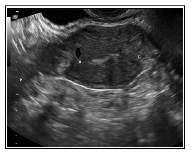
Fig.1: Coronal view of the fundus of the uterus on transvaginal ultrasound showed a mass measuring 2 cm in the right uterine horn and the interstitial line sign (black arrow).

Considering the serum level of \beta -hCG (<10000 IU/L), the patient's haemodynamic stability, the size of the mass (diameter <4 cm), the absence of pelvic free fluid and the absence of haematologic, renal and hepatic impairment, systemic MTX therapy was recommended as a first option for treatment. The patient was given an intramuscular