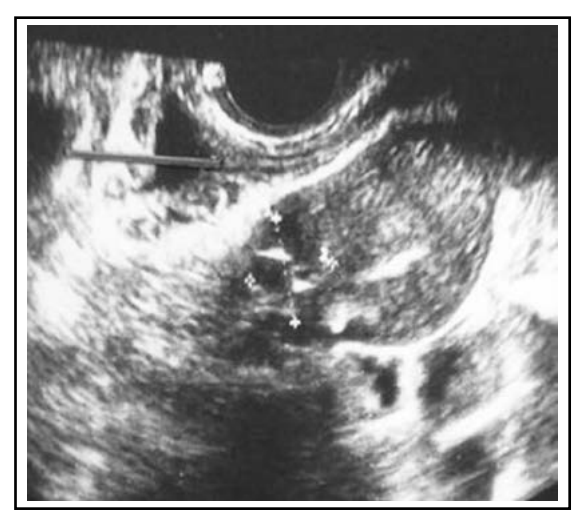
Fig.3: Transvaginal ultrasound image (coronal plane) showed a gestational sac in the left uterine horn.

condition was stable. Her complaints included vaginal bleeding, left-lower quadrant pain and 17 days of amenorrhea. Abdominal examination revealed left-lower quadrant tenderness. Bleeding from the cervical canal was noted.