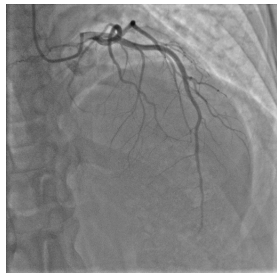
Figure 2 Critical narrowing of left anterior descending artery in the presented patient close to the apical region with flow cessation possibly with residual thrombus, no evidence of significant narrowing in other vessels.