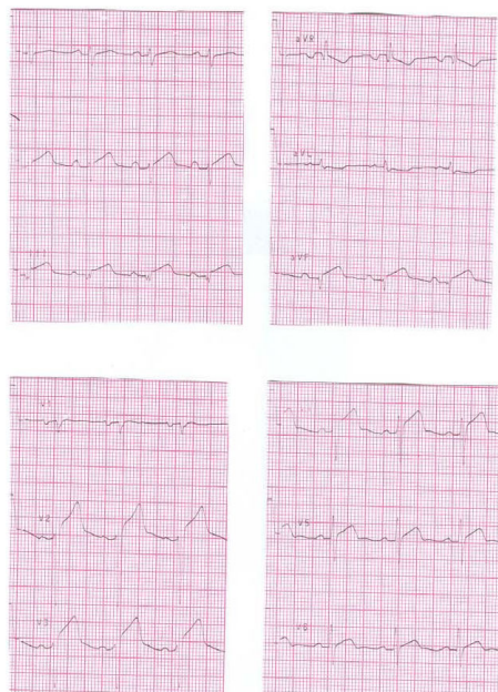
Figure 1 Admission ECG of the presented patient with acute myocardial infarction and thyrotoxicosis. The tracing demonstrates 2-3 mm ST segment elevations in II, III, aVF as well as V2 to V5.

Both hyper- and hypothyroidism are known to be associated with coagulation abnormalities. In case of hypothyroidism the data are somehow conflicting and