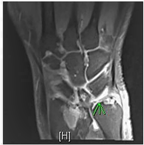
Figure 2 A 60-year-old woman with severe RA. Follow-up MRI showed perforation at the left disc proper of the triangular fibrocartilage complex.

RA with high disease activity and having undergone wrist MRI and ultrasound examinations.