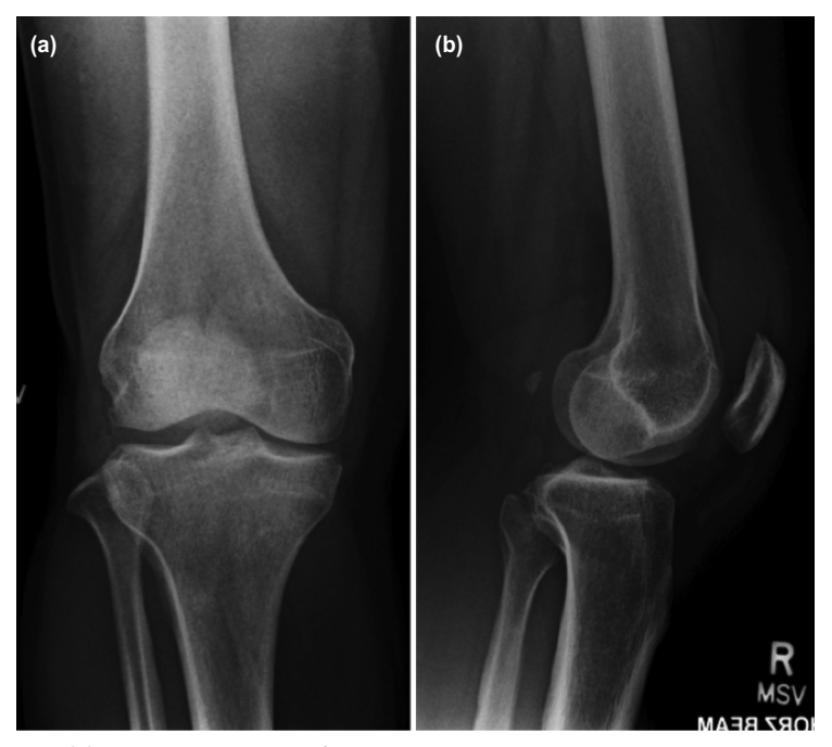
Fig. 1: (a) Antero-posterior and (b) lateral radiographs of the right knee did not reveal any radiographic signs of chondrocalcinosis.