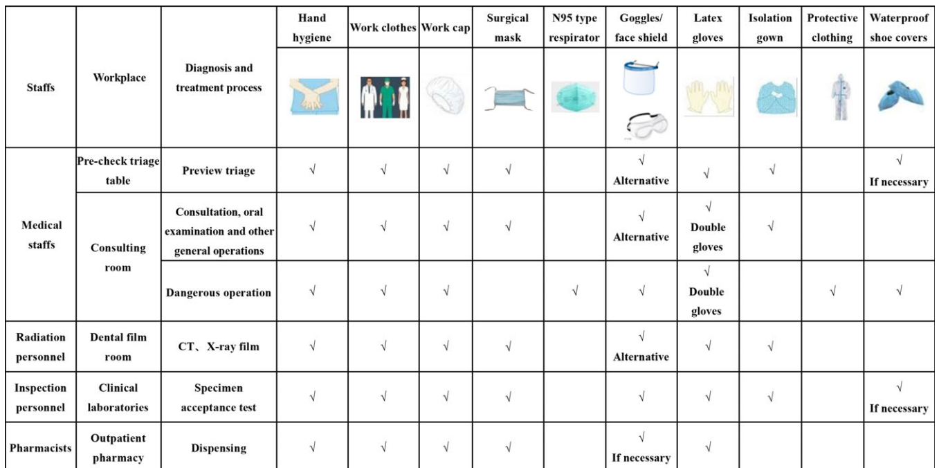
Figure 2 Medical Personnel Graded Protection.