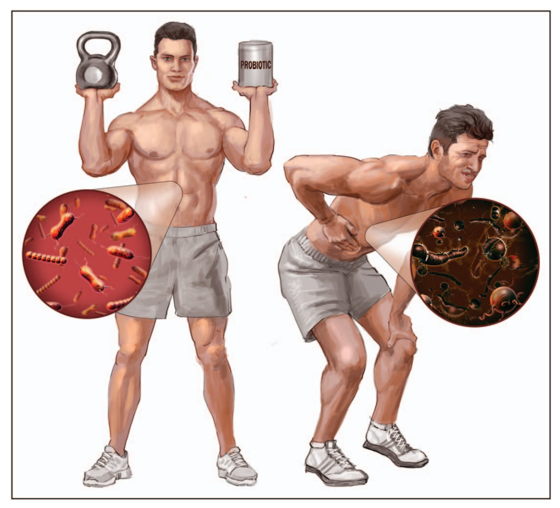
FIGURE 1. Supplementation with certain probiotic strains has been shown to increase gastrointestinal and immune health, improve nutrient absorption, speed up recovery, and improve athletic performance (illustration by Stephen Somers, Milwaukee, Wisconsin, USA).

exercise-induced gastrointestinal distress. Although it is generally accepted that a reduction in splanchnic blood flow is one of the main factors precipitating exercise-induced gastrointestinal symptoms, there are many other elements that contribute to different symptoms (e.g., nausea, vomiting, bloating, and diarrhea). To evaluate the effects of probiotic supplementation on gastrointestinal symptoms, circulatory markers of gastrointestinal permeability, damage, and markers of immune response during a marathon race, 24 recreational runners were randomly assigned to either supplement with a multistrain probiotic consisting of Lactobacillus acidophilus (CUL60 and CUL21), Bifidobacterium bifidum CUL20, and Bifidobacterium animalis ssp. Lactis (totaling 25 \times 10^9 CFU) or placebo for 28 days prior to a marathon race [9]. Although there were no differences in race finish times between probiotic and placebo groups, those in the probiotic supplement group were better able