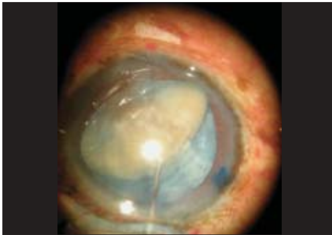
Figure 5: Trypan blue assisted nucleus prolapse in white cataract

hook even without hydroprocedures if the cortical attachment with the nucleus is loose. It will also be worthwhile to debulk the cortical matter using a simcoe cannula before prolapsing the nucleus. The capsular staining helps in performing the difficult step of nucleus prolapse through an intact capsulorrhexis safe and effortless, because the dye stained capsular rim is distinctly visible throughout the surgery. A Sinskey hook is used to retract the stained capsulorrhexis to engage the equator and lever out one pole of the nucleus outside the capsular bag and the rest of the nucleus is rotated into the anterior chamber [Fig. 4]. During this technique, any compromise to the capsular bag can be detected easily and relaxing incisions can be made at any point of the process, thereby saving the intracapsular removal of the nucleus. [12]