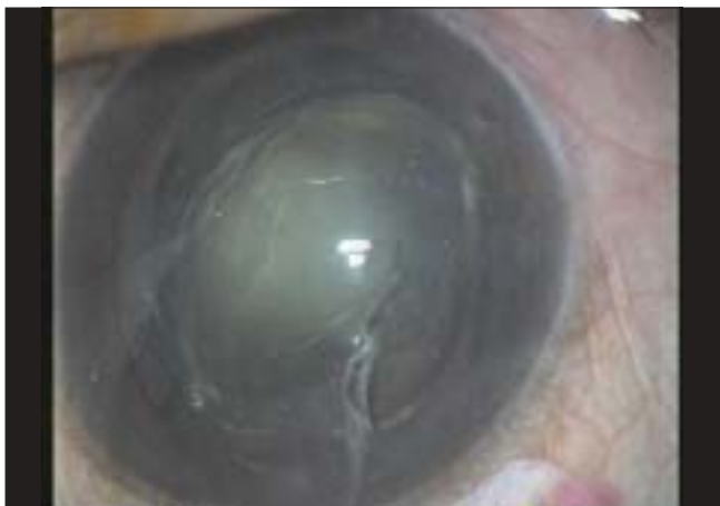
Figure 3: Intracapsular flip in progress