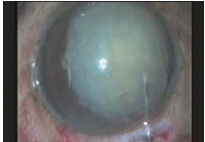
Figure 2: Completion of the prolapse using a Sinskey hook