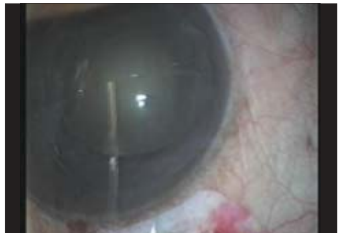
Figure 4: Nucleus lying in the anterior chamber