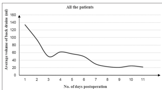
Figure 3: The average volume collected from back drains of all patients for each postoperative day.

Among all 24 patients with seroma, the mean total volumes from the back drains, and all drains were 434 \pm 150 ml and 569 \pm 190 ml, respectively. Notably, the total volumes from the back drains ( 524 \pm 109 ml vs. 324 \pm 116 ml, P < 0.001 ) and all drains ( 659 \pm 170 ml vs. 462 \pm 153 ml, P = 0.010 ) were significantly higher in the LD group than those of the LD + implant group [Table 2]. In addition, the time to drain removal was significantly longer in the LD group than that of the LD + implant group ( 8.2 \pm 1.4 days vs. 6.6 \pm 1.1 days, P = 0.006 ; Table 2). The longest indwelling period of back drainage was 11 days, and the average drainage volumes were around 20 ml/day over a 3-day period before the removal of the back drain [Figure 3].