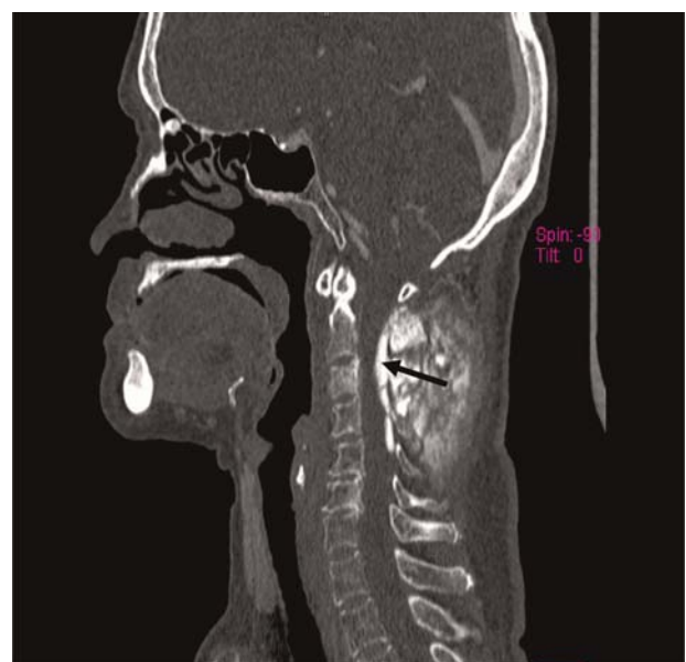
Fig. 3 Sagittal reconstructed CT of the neck showing ossified intradural tumor posteriorly in the spinal canal from C2 to upper C5 level. Extensive intradural spread is a very rare finding in cervical osteosarcoma

The clinical presentation varies depending on the level of vertebral involvement. Pain is the commonest presenting feature. Over 85% of patients complain of pain, particularly severe neck pain when the cervical vertebrae are involved. Other clinical features include neurological symptoms