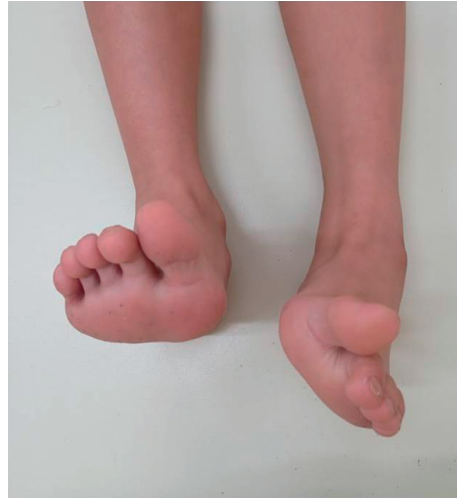
FIGURE 1: A photograph showing uncorrectable equinovarus deformity of the left foot on nonweight-bearing frontal view.