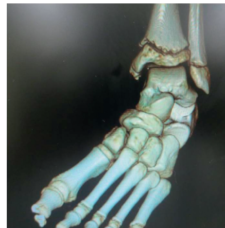
FIGURE 3: Dislocation of the left Chopart joint complex can be seen on the frontal computed tomography image.

CD is much more likely to involve paralysis or weakness than rigidity or contracture [5, 6]. There has been only one report of atraumatic rigid psychogenic equinovarus accompanied by CD to date [8]. To our knowledge, the present report is the first of rigid psychogenic equinovarus confirmed on CT images that was caused by dislocation of the Chopart joint complex in a patient in whom physical symptoms were associated with psychological stressors and could not be explained by organic pathology. Our case