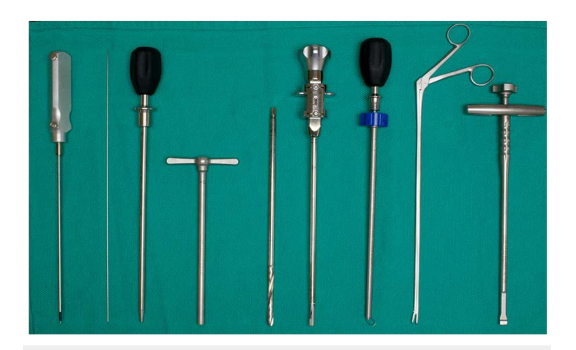
FIGURE 4: Instrumentation used for MIS-DTIF

phosphate (TCP, Berkeley Advanced Biomaterials Inc., Berkeley, CA) that had been soaked in autologous bone marrow aspirate drawn through a Jamshidi® needle (BD, New Jersey, USA) from one of the pedicles above the interested level [20]. The K-wire was once again placed in through the working tube and the tube was removed. Next, the cone-shaped PEEK Zeus-O cage was inserted over the K-wire and guided through the pleural space using biplanar fluoroscopic imaging. Once the cage was positioned on the top of the disc, it was entered into the disk space with mallet taps until one-third of the cage was past the midline. At this point, the insertion device was removed and the pleural space was sutured in two layers. The discectomy and cage placement in the lateral fluoroscopic view are in Figure 3, panels 3-6.