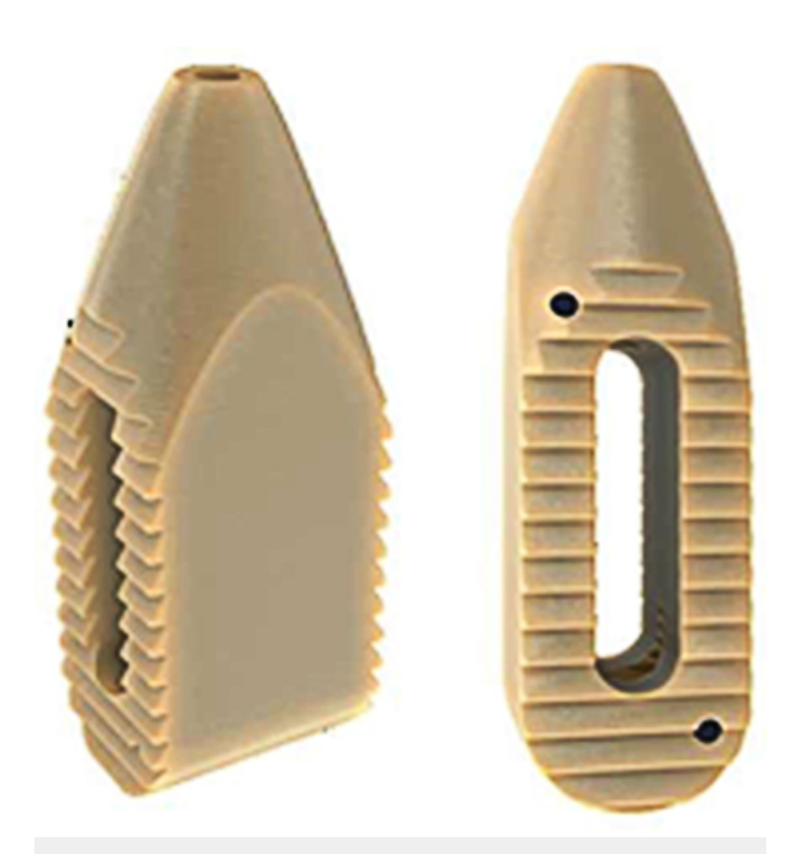
FIGURE 1: PEEK Zeus-O cage with bullet-nosed tip

For the setup of the bilateral fluoroscopy, it is important that the endplates of the target level line up well in the lateral view and the ribs are exactly leveled. In the anterior-posterior (AP) view, the disk needs to be visible and the spinous process should be centered between the pedicles. Electrophysiological monitoring was set up on the major muscle groups and the skull to monitor somatosensory evoked potentials, electromyogram, and transcranial motor evoked potentials throughout the surgery.