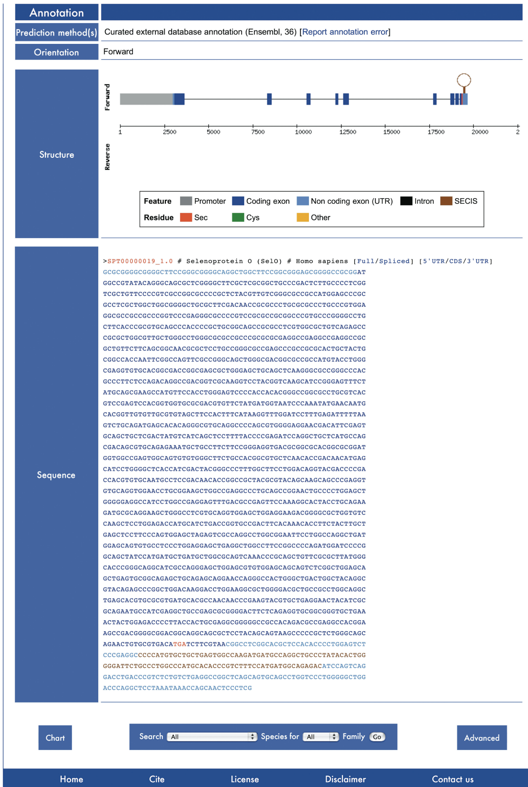
Figure 3. Transcript Report of human SelO. Note the color coded gene structure and the spliced transcript sequence with sequences features colored accordingly. Other sequence views are one click away at links at the end of the sequence ID line.