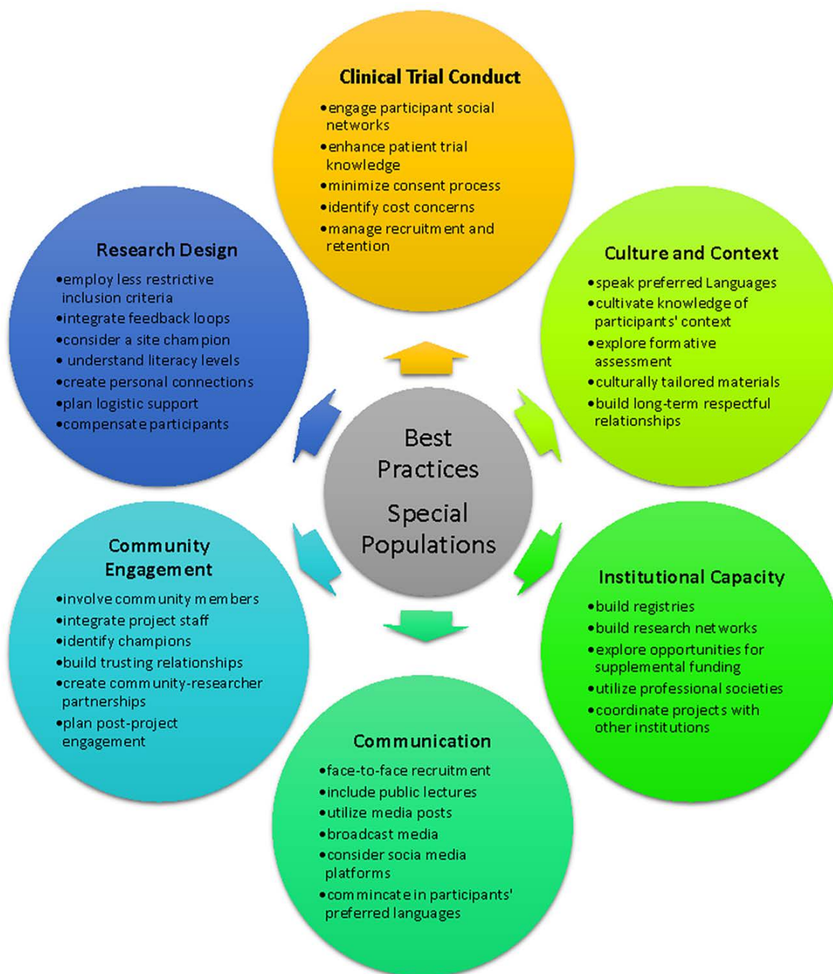
Figure 2. Summary points for improved clinical trials accrual and retention for participants from special populations.

“situated” to appropriately accommodate the participants’ reality. Researchers and the scientific process will benefit from better understanding of participants’ social, economic, and cultural contexts. This can include simple things such as knowing how and when to employ culturally appropriate forms of address [31], ways of asking questions [33], or knowledge of relevant holidays and religious observances or more complex culturally and contextually based perspectives, beliefs, behaviors, and