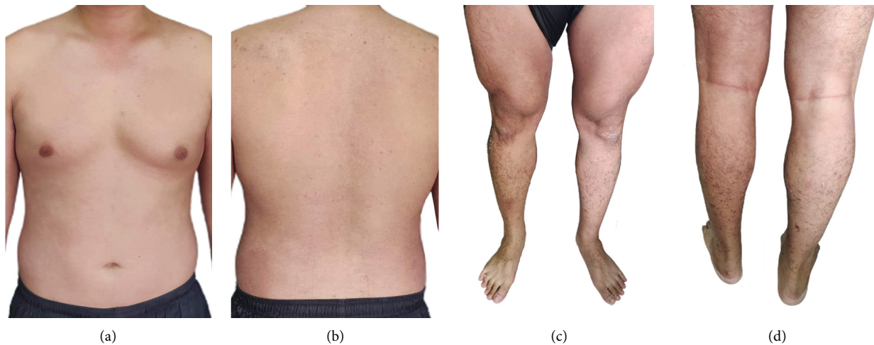
FIGURE 3: Recovery of the skin lesions from generalized erythema at the upper body: (a) front and (b) back and lower body: (c) front and (d) back were close to normal.

visit (Figure 1(b)). Clinical follow-up 15 weeks later was done to exclude erythrodermic and pustular psoriasis in this patient and no remission was observed. Recovery of the skin lesions from generalized erythema was closed to normal (Figures 3(a)–3(d)). Clinical follow-up was continued once a month for 6 months. No signs of erythrodermic psoriasis as well as recurrent erythroderma were observed. Moreover, symptoms of erythroderma in this patient with no rash on the palms/soles of the feet were reminiscent of less erythrodermic psoriasis.