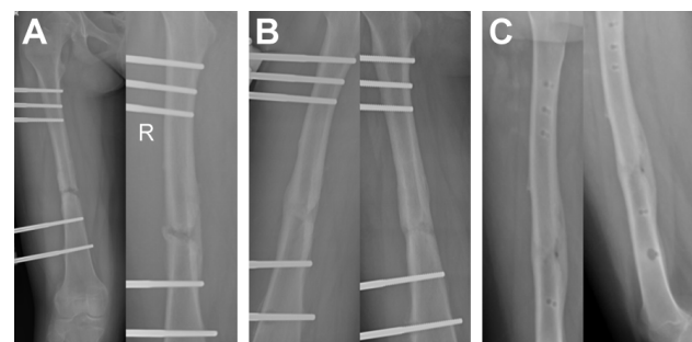
Figure 2 X-ray images of femoral fracture treated by external fixation and PABMT. A 12-year-old girl sustained a femoral shaft fracture in a traffic accident and was treated with external fixation. The frontal and lateral X-ray films showed clear fracture line with a small amount of callus 4 months after fixation. The girl was included in this study, and autologous bone marrow was injected to the delayed union site (A). One month later, there were obvious bony calluses, but the fracture line was visible (B). In the next 2 months, the patient underwent bone healing, and the external fixator was removed (C).

However, the patients' general characteristics such as sex, fracture location, and fixation did not have statistical influence on PABMT results.