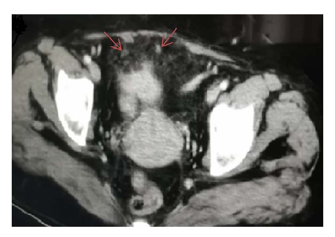
Figure 1: CT scan of abdomen and pelvis axial view showing intra-abdominal gallstones.

Although early complications often occur in the form of peritonitis or abscesses, late complications usually occur as a