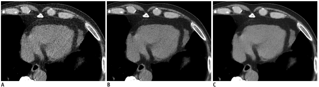
Fig. 2. Comparison of low-dose chest CT scan in axial soft tissue window images of mediastinum in 73-year-old man. Reconstruction was performed with ASiR-V 30% (A), DLIR-M (B), and DLIR-H (C). Signal did not significantly vary across different reconstructions. However, image noise of DLIR images was lower than that of ASiR-V 30% images (ASiR-V 30% vs. DLIR-M, ASiR-V 30% vs. DLIR-H, and DLIR-M vs. DLIR-H, all p < 0.001 ).

Recently, several clinical studies on deep convolutional neural network-based reconstruction techniques have reported that DLIR yields favorable noise texture with superior image quality alone and a significantly reduced image noise in coronary CT angiography (9, 13, 14) and abdominal CT scan (8, 12, 15, 16). Although the locations