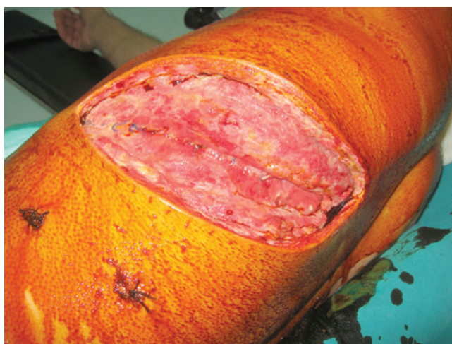
Figure 2 - A patient's necrotic and suppurative tissues, including the skin, subcutaneous tissue and muscle layers, were observed before debridement. Only the pericostal sutures were intact.

An en block approximation technique combined with debridement was performed under general anesthesia in 16 (66%) of the DTI patients. In two patients, superficial general anesthesia was provided because these individuals did not appear to tolerate intratracheal general anesthesia because of their poor general health status. Debridement and suturation were performed in eight patients with local anesthesia. Pathogenic microorganisms were isolated from the cultures of six of these eight patients. The improvement was complete in the patients whose interventions were conducted under local anesthesia. Successful results were obtained in 14 (87.5%) of the 16 patients whose en block approximation was performed under general anesthesia.