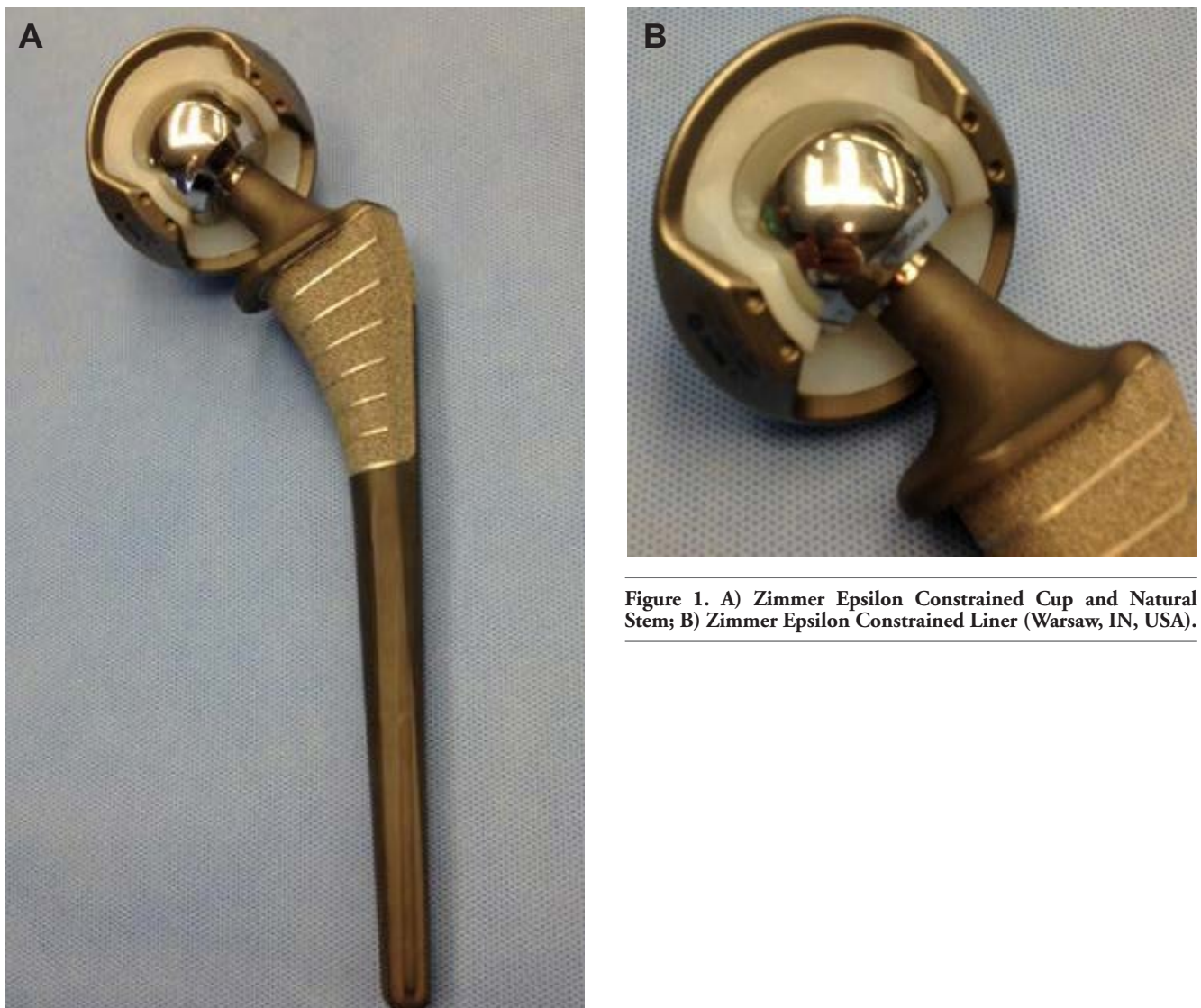
Figure 1. A) Zimmer Epsilon Constrained Cup and Natural Stem; B) Zimmer Epsilon Constrained Liner (Warsaw, IN, USA).

Radiographs were examined for changes indicating loosening or osteolysis within the zones designated by Gruen et al. and DeLee and Charney. 14,15 Stem subsidence was evalu-