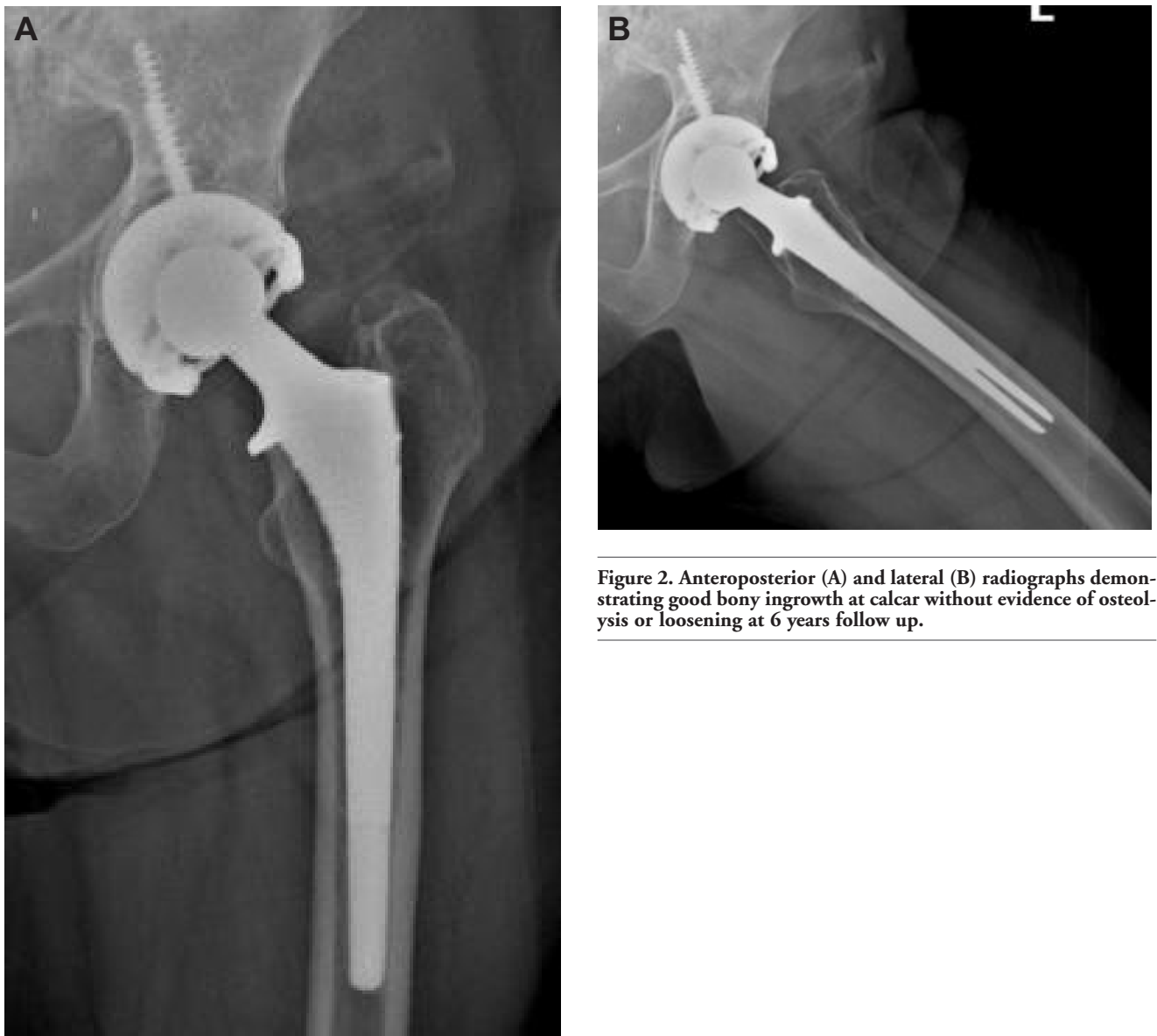
Figure 2. Anteroposterior (A) and lateral (B) radiographs demonstrating good bony ingrowth at calcar without evidence of osteolysis or loosening at 6 years follow up.

In 2001, Burroughs et al. published on a novel constrained liner that is similar to the component utilized in this study. They presented ROM and lever-out tests for this implant demonstrating significantly improved results over the components commonly in use. 12 Berend, presented a cohort of 81 similarly constrained THAs for complex revision and found 98.8% stability at 9 months. 6,11 The prosthesis utilized had favorable mechanics based on use of a 36 mm non-skirted head in conjunction with a liner that is equatorially flat, increasing ROM to 110° of flexion compared to 90° with their previously used device as well as 30% increased lever-out strength. He did not report on findings of loosening but found that a con-