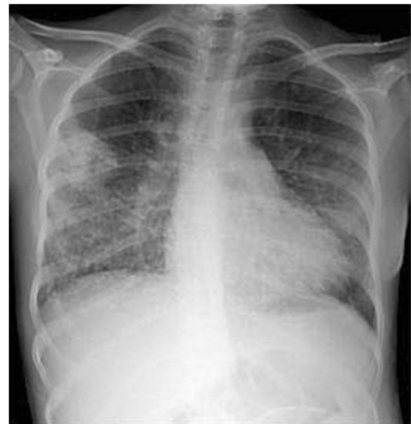
Fig. 1 Chest x ray in a 16-year old girl affected by granulomatosis with polyangiitis (GPA). The image shows multiple nodular lesions together with diffuse opacities in the lower and middle regions of the lung

Conventional chest X rays can easily detect nodules and masses, fixed infiltrates, cavitations, pleural effusions and pneumothoraces, while small nodules, linear opacities, focal infiltrates and fluffy perivascular densities are best identified using high-resolution computed tomography (HRCT) [17] (Fig. 2). Bilateral perihilar and basal infiltrates of alveolar haemorrhage may resemble pulmonary oedema, but differential diagnosis can be based