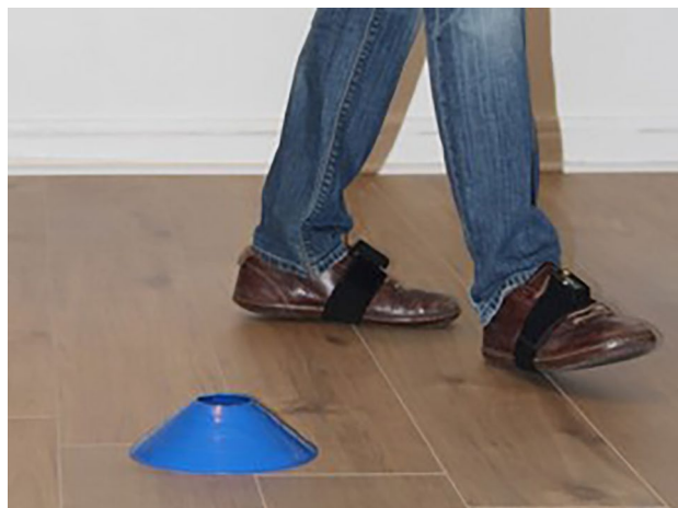
Figure 1. Picture showing the placement of the two foot-worn inertial sensors.