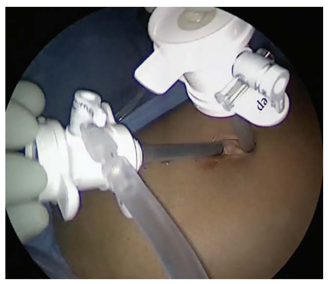
Figure 1. Two trocars are noted at the patient's umbilicus.

In the setting of adnexal surgery, the freed specimen was placed in a laparoscopic specimen retrieval bag and removed from the posterior colpotomy port site. If necessary, they were morcellated vaginally within the bag. In the setting of hysterectomy, the posterior colpotomy incision was incorporated into the full colpotomy at the end of the procedure. The colpotomy incision was then closed vaginally with a delayed absorbable suture. At completion of the procedure, the patients had 2 5-mm laparoscopic incisions and a reapproximated colpotomy incision ( Figure 4 ).