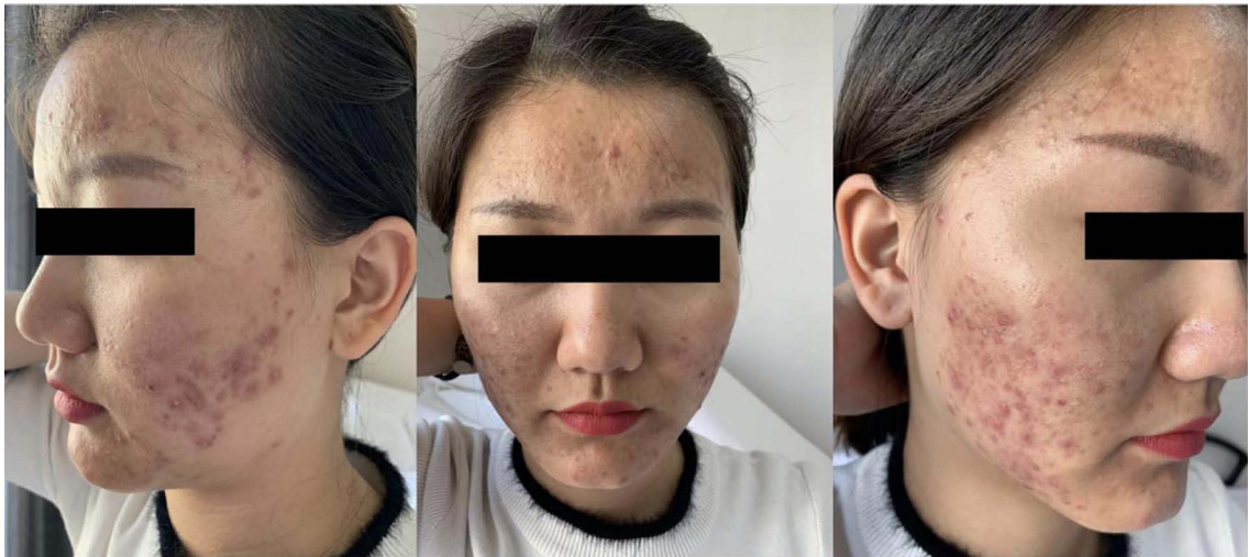
Figure 3 A female patient aged 20 of the observed group. Frontal and bilateral clinical photos of the face before treatment.