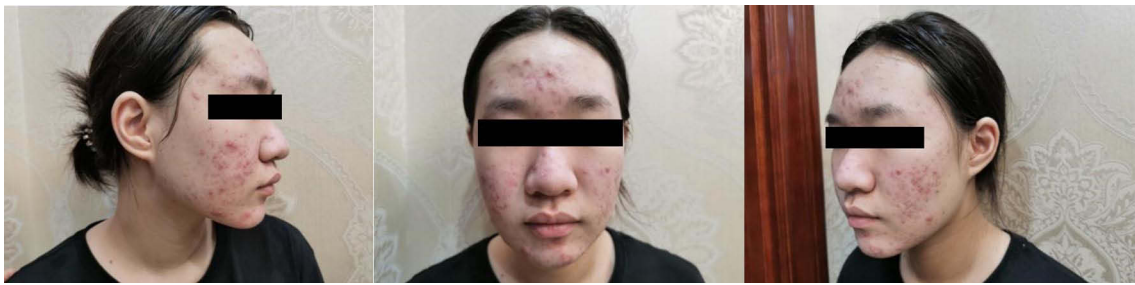
Figure 2 A female patient in control group: follow up 6 months after treatment.